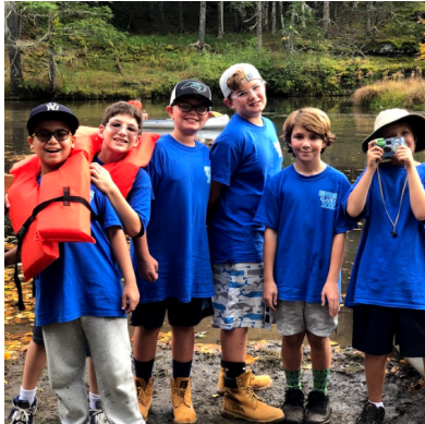
RIVERSIDE & WILSON

Wilson and Riverside Elementary students engaged in a number of activities on their annual Ashokan trip. Students learned canoeing, team building, natural science and watershed studies. They also roasted marshmallows on a campfire.